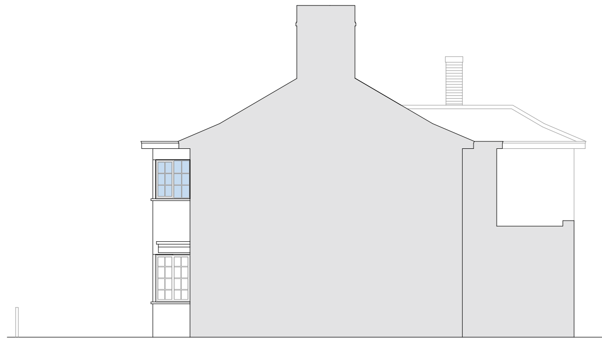
Proposed Side Elevation 1:100 @ A3