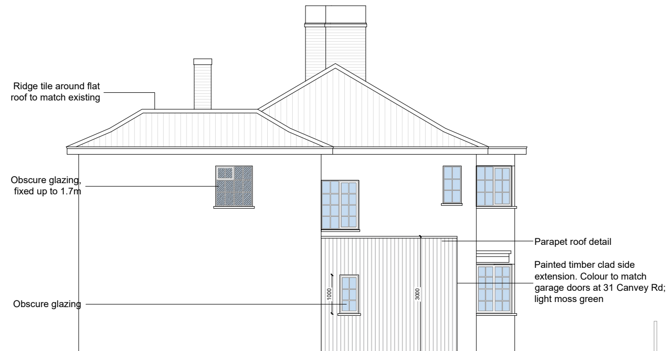
Proposed Side Elevation 1:100 @ A3