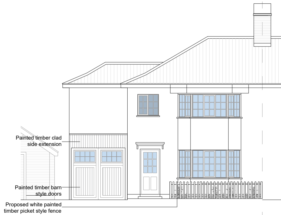
Proposed Front Elevation 1:100 @ A3